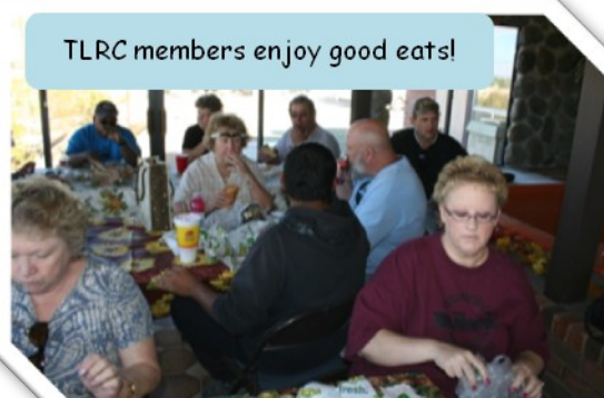
TLRC members enjoy good eats!