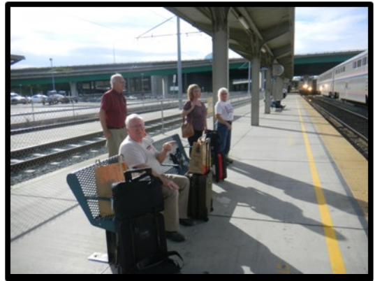
Mattel #999-99 Passengers Standing w/one seated